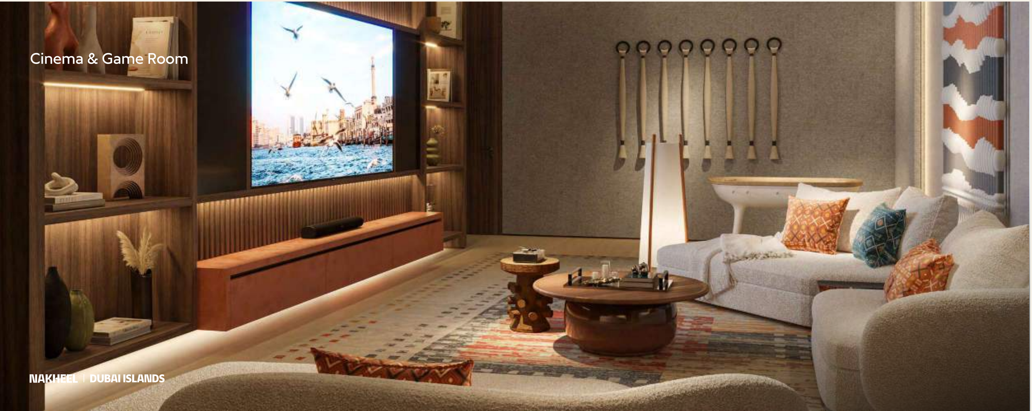
Cinema & Game Room

Adjacent to it, the cinema room provides a cosy retreat for movie nights, private bookings, or casual get-togethers.